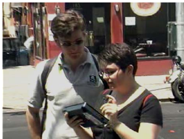
Fig. 4. Testing MATCH in NYC

The instantiation of a rapid logging and evaluation process within MATCH enhanced our ability to evaluate the system's strengths and shortcomings as development proceeded, leading to an iterative development process. Small pilot studies with a handful of test users (mostly summer interns and AT&T researchers) were conducted initially both in the lab and on the streets of New York (Figure 4), during which consistent problems in the system were identified using the log viewer. The ability to identify and analyze problems almost as soon as the user had finished proved invaluable for making rapid improvements that could be re-tested on other users.