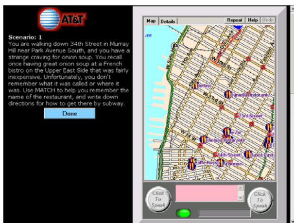
Fig. 5. MATCH with a User Test Scenario

You are walking down 34th Street in Murray Hill near Park Avenue South, and you have a strange craving for onion soup. You recall once having great onion soup at a French bistro on the Upper East Side that was fairly inexpensive. Unfortunately, you don't remember what it was called or where it was. Use MATCH to help you remember the name of the restaurant, and write down directions for how to get there by subway.