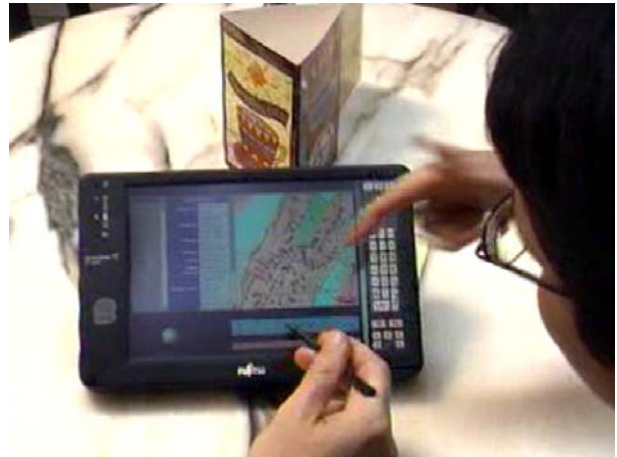
Fig. 1. MATCH running on Fujitsu PDA

handwritten words. System output is multimodal as well, combining synthesized speech with icons and descriptive call-outs presented dynamically on the map. MATCH’s architecture is modular and distributed, with multiple components that work in concert by communicating through XML strings over TCP/IP. The user interface runs from an ActiveX control embedded in a browser. MATCH functions either as a thin client on a small portable device, or can run standalone on a tablet PC (Figure 1).