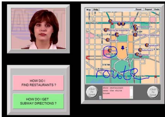
Figure 2: Kiosk Interface

the top left there is a photo-realistic virtual agent (Cosatto and Graf, 2000), synthesized by concatenating and blending image samples. Below the agent, there is a panel with large buttons which enable easy access to help and common functions. The buttons presented are context sensitive and change over the course of interaction.