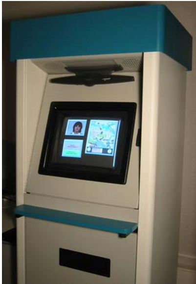
Figure 1: Kiosk Hardware

the top left there is a photo-realistic virtual agent (Cosatto and Graf, 2000), synthesized by concatenating and blending image samples. Below the agent, there is a panel with large buttons which enable easy access to help and common functions. The buttons presented are context sensitive and change over the course of interaction.